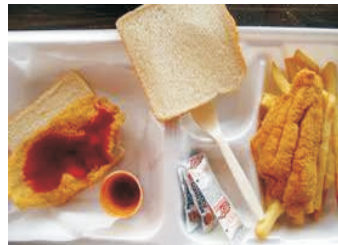
School Food a good idea gone amok

The brand new web site has an introductory slide show, a section titled "12 Things Every School Lunch Activist Should Know," and a series of articles giving more detail on how to proceed. Please share it with your social network.