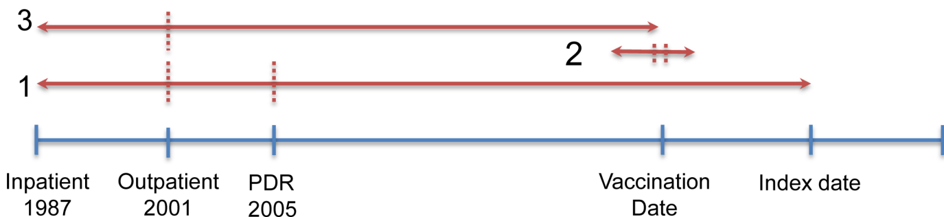
Fig 2. Exposure windows. 1. Prescription (ATC) and diagnosis (ICD10) history before index date (MSLT-referral date). Ever was defined as after the first date in either the inpatient register (1987), outpatient register (2001) or prescribed drug register (2005) and prior to the index date. 2. Prescription (ATC) and diagnosis (ICD10) history during the vaccination period. This period extended to six months before to one month after A(H1N1)pdm09 vaccination (specific to each individual). For acute infections (bacterial (ATC J01) and viral (ATC J05)) this period was shortened to two weeks before to two weeks after vaccination. 3. Prescription (ATC) and diagnosis (ICD10) history before vaccination. Ever was defined as after the first date in either the PDR (2005), inpatient register (1987) or outpatient register (2001) and prior to the vaccination date.

Conditional logistic regression was used to estimate odds ratios (OR) together with 95% confidence intervals (95% CI). Given the rarity of narcolepsy in the general population, ORs were