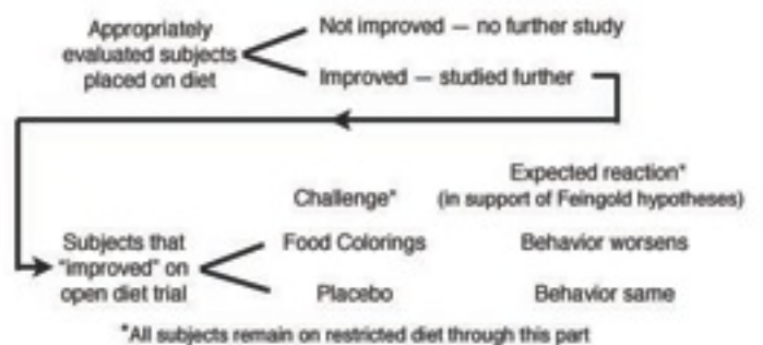
FIGURE 1. Research design of challenge studies.

In the 1975 report to The Nutrition Foundation, the National Advisory Committee on Hyperkinesia and Food Additives recommended that studies designed to test the Feingold hypothesis employ a "challenge design," which would necessitate the production of an appropriate challenge material. A typical challenge design study is illustrated in Figure 1. Subjects are placed on the restrictive diet (in this case the Feingold diet) and then, while continuing to observe the dietary restrictions, specific substances that have been removed from the diet are fed to the subjects in the form of a challenge. If the subject has improved on the restrictive diet and, if this improvement is due to the elimination of specific chemicals, the subject should then deteriorate when those chemicals are again consumed under experimental conditions. Since deterioration in behavior might occur because the experimenter, the subject, and his family are