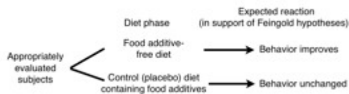
FIGURE 2. Research design of control diet studies.

expecting that to happen (placebo effect), the challenge must be made by offering, in a double-blind fashion, a placebo as well as food containing the suspected substance. The active challenge is a food that contains the chemicals previously excluded in the diet, and the placebo looks and tastes just like the active challenge but does not contain the presumably offending chemicals. 12 This type of challenge study seemed particularly appropriate since Dr. Feingold repeatedly stated “that any infraction of the diet, either deliberate or fortuitous, induced a recurrence of the clinical pattern within two or four hours with persistence for 24 hours to 96 hours (4 days). In other words, we could turn the pattern on and off at will.” 17